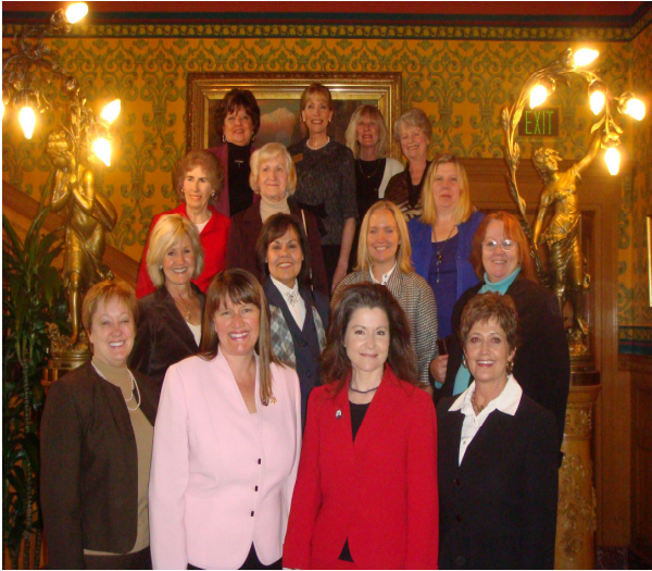
REGENTS EVENT AT THE GOVERNOR'S MANSION