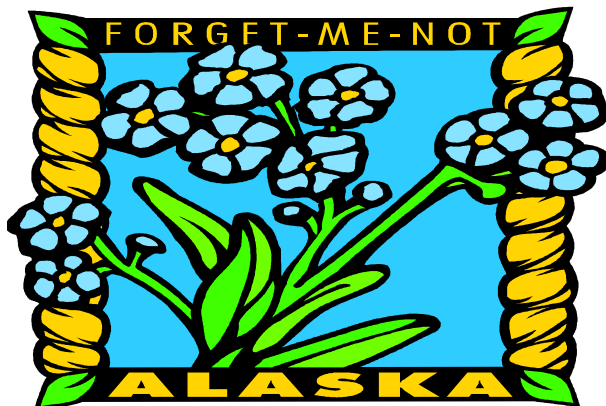
State flower of Alaska

A special thanks to each of you who contribute to the WCRW Newsletter. You make my job easy and fun.