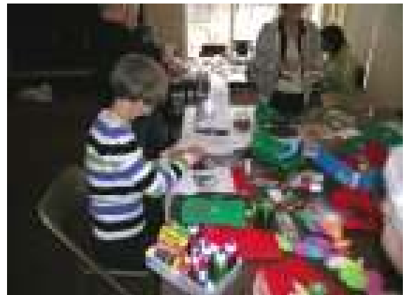
WCRW met together to make stockings for 222 nd National Guard troops and their children.